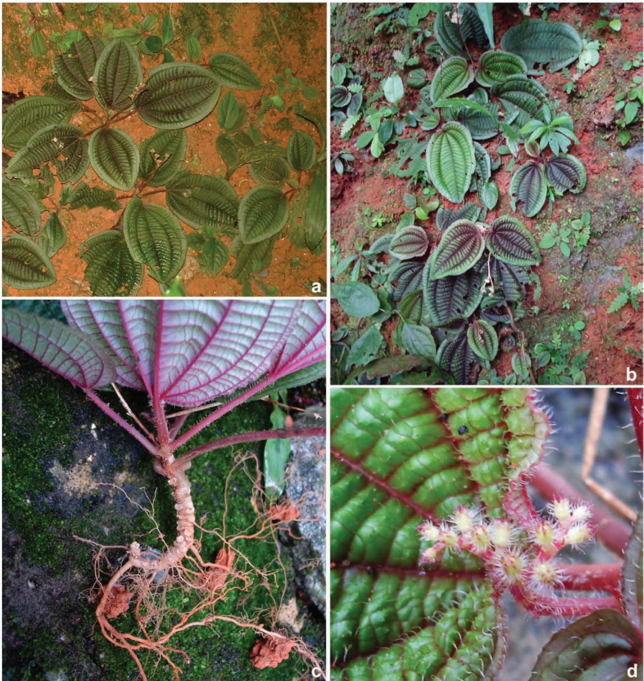
FIGURE 1. Bertolonia organensis Baumgratz, Gonçalves-Silva & Nunes-Freitas: a–b. habit and infructescences; c. detail of the abaxial leaf blade, stem and roots; d. inflorescence with flower buds.

Distribution and Habitat: — Bertolonia organensis is endemic to Brazil, and it was found in a single locality in southeastern Rio de Janeiro state, municipality of Magé, district of Santo Aleixo, in Serra dos Órgãos National Park, in the southeastern Serra do Mar range. It is restricted to Serra dos Órgãos, in Atlantic Rain Forest ( Floresta Ombrófila Densa Submontana ), at about 230 m elev., growing on clay soil at a shaded hillside bordering the trail, beneath a rock outcrop. The Serra dos Órgãos National Park is a Federal Conservation Unit established in 1939. It has a very rugged topography, with ca. 20.024 ha, and a wide altitudinal range (100 to 2.263 m), with the ocean side wetter than the north and west faces. The average annual temperature is between 13 and 23 °C and it is covered with dense submontane to high montane tropical rainforests ( Floresta Ombrófila Densa Submontana , Montana and Alto-Montana ), including high altitude grasslands ( Campos de Altitude ) (Cronemberger & Castro 2007).